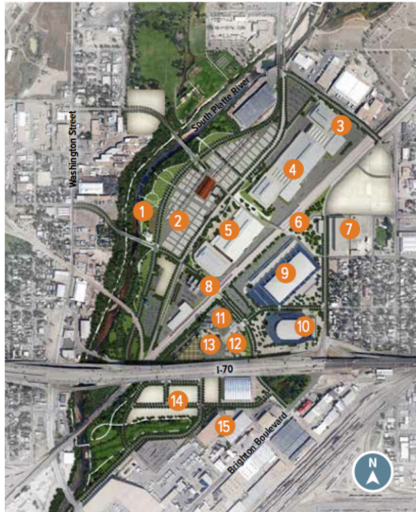
Illustrative Master Plan

Engage with the National Western Center Partners to implement projects that are directly in line with UWP goals and priorities.